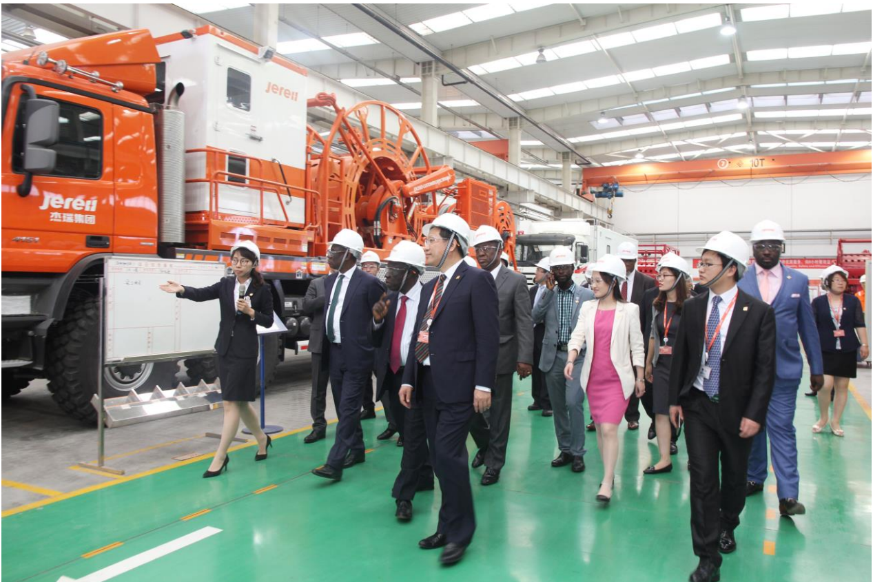
The Delegation Visited Jerel Oilfield Equipment Manufacturing Park