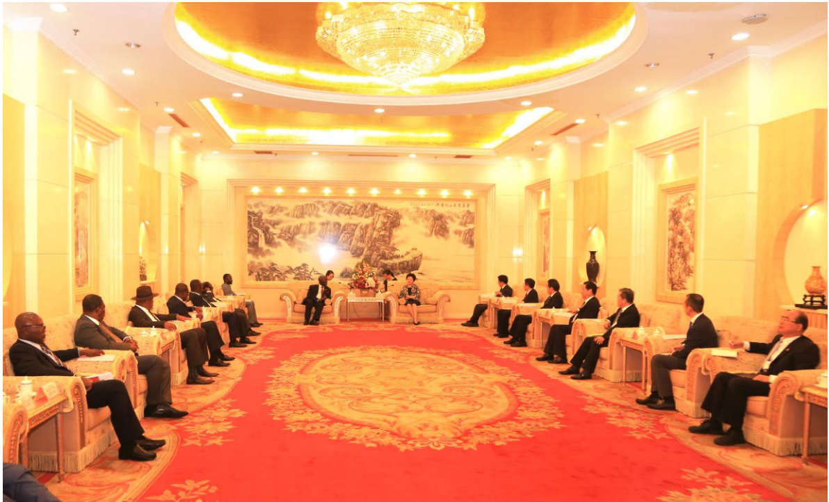
The Delegation Meets the Mayor of Yantai City, Madam Zhang Yongxia